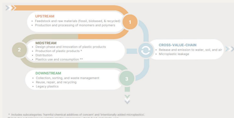
Figure 1: Dreyer et al. 2024, p. 11 [1].

The full life cycle approach for plastics is an important concept in the negotiations for an effective global plastics treaty. The full life cycle encompasses the upstream phase, or the extraction of the raw materials, as well as mid- and downstream phases, including product design and waste management, amongst others (see Figure 1).